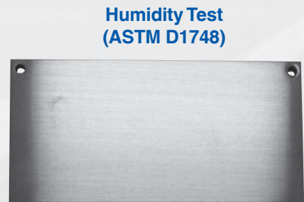
AMSOIL Firearm Cleaner (no corrosion)