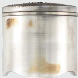
SABER Professional @ 100:1