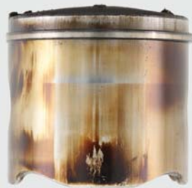
ECHO Power Blend @ 50:1