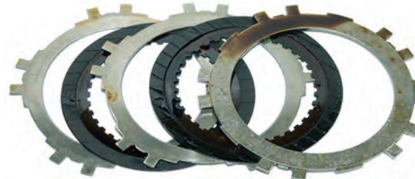
Automatic transmission clutch plates after cleanup with AMSOIL Engine and Transmission Flush reveal lighter glazing and varnish.