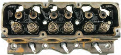
Cylinder head pre-cleanup. Note the sludge deposits on and around the valve springs and push rod openings.