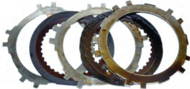
Automatic transmission clutch plates pre-cleanup. Varnish and glazing is heavy on some of the plates.