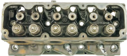
Cylinder head after cleanup with AMSOIL Engine and Transmission Flush. The valve springs and push rod openings are noticeably cleaner, with fewer sludge deposits. The manufacturer's stamping is more easily seen.